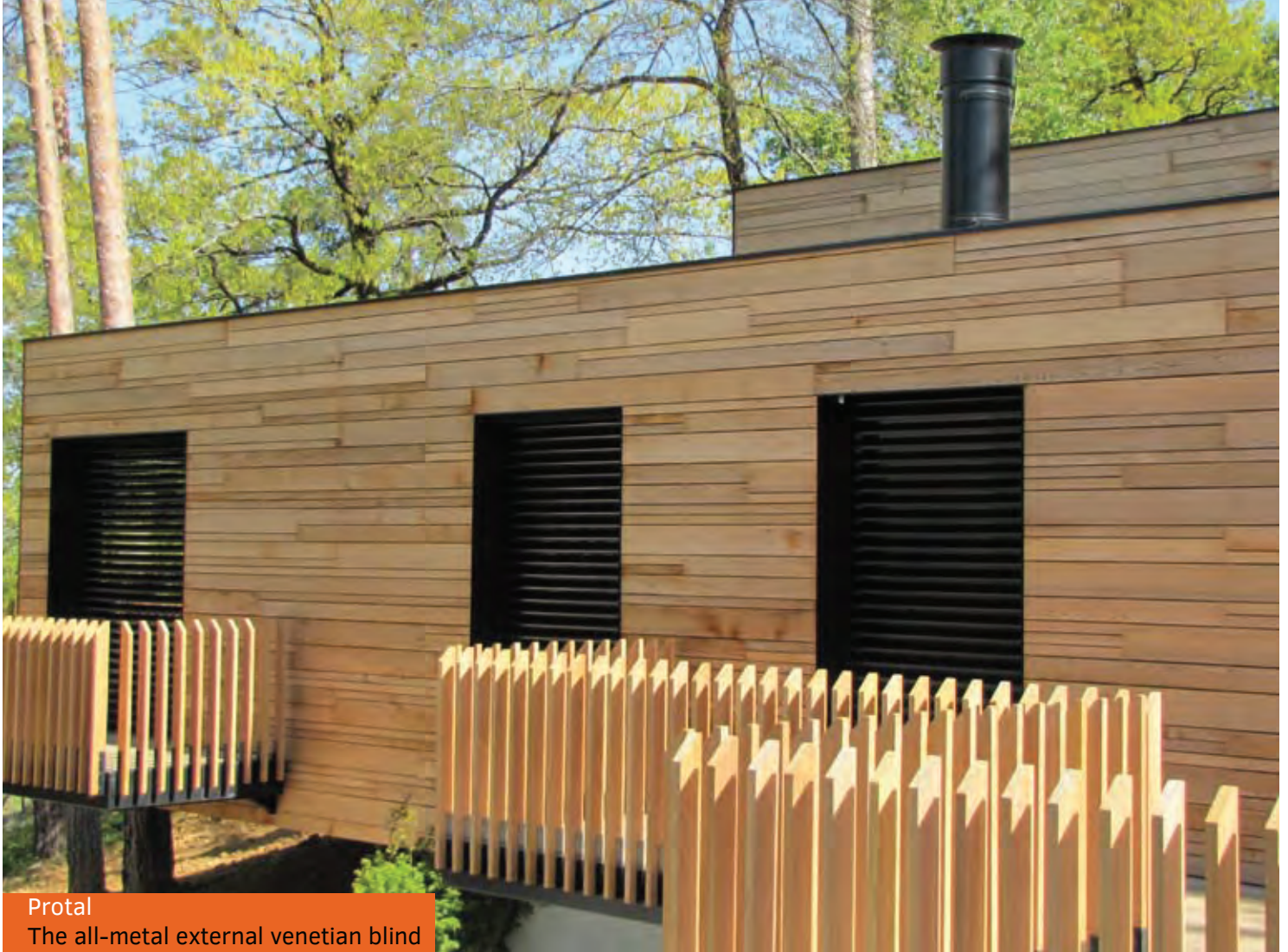
Protal The all-metal external venetian blind